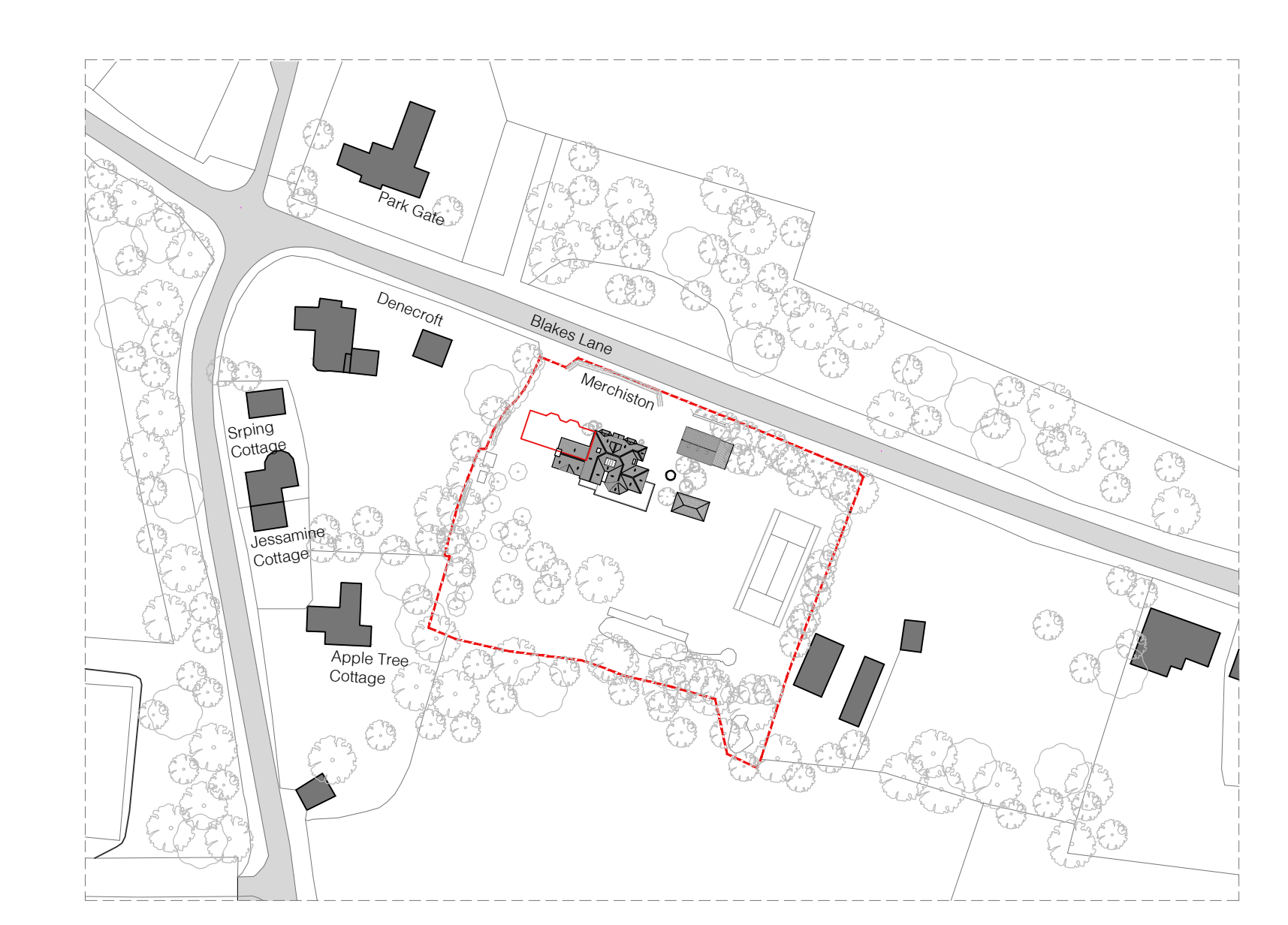
1 Location Plan 1:1250